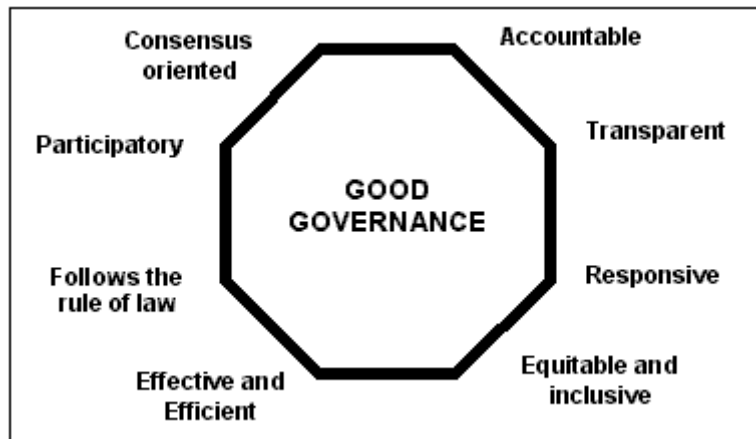
Figure 2: Characteristics of good governance

Good governance requires that institutions and processes try to serve all stakeholders within a reasonable timeframe.